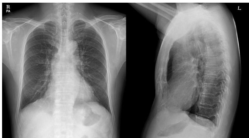
Figure 1. The posteroanterior and lateral chest X-rays show mild fattening of the diaphragms.

asthma since childhood. Over the previous 3 years, his cough, sputum, and dyspnea had worsened and he had experienced intermittent episodes of shortness of breath with wheezing at night. Whenever the symptoms developed, he would visit a nearby clinic where he was treated with oral prednisone and inhaled salbutamol. He was advised to undergo regular treatment including inhaled corticosteroids (ICS), but he did not follow his physician's advice.