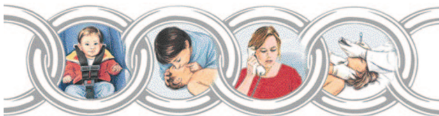
FIGURE 1 Pediatric chain of survival.

The United States has the highest firearm-related injury rate of any industrialized nation—more than twice that of any other country. 28 The highest number of deaths is in adolescents and young adults, but firearm injuries are more likely to be fatal in young children. 29 The presence of a gun in the home is associated with an increased likelihood of adolescent 30,31 and adult suicides or homi-