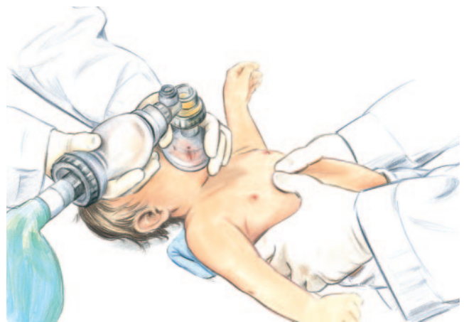
FIGURE 5 Two thumb-encircling hands chest compression in infant (2 rescuers).

should compress the lower half of the sternum with the heel of 1 hand or with 2 hands (as used for adult victims) but should not press on the xiphoid or the ribs. There are no outcome data that show a 1-hand or 2-hand method to be superior; higher compression pressures can be obtained on a child manikin with 2 hands. 111 Because children and rescuers come in all sizes, rescuers may use either 1 or 2 hands to compress the child’s chest. It is most important that the chest be compressed about one third to one half the anterior-posterior depth of the chest.