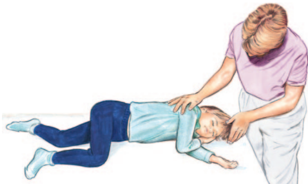
FIGURE 3 Recovery position.

In an infant, use a mouth-to-mouth-and-nose technique (level of evidence [LOE] 7; Class IIb); in a child, use a mouth-to-mouth technique. 55