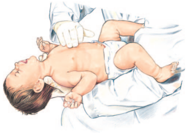
FIGURE 4 Two-finger chest compression technique in infant (1 rescuer).

In a child, lay rescuers and health care providers